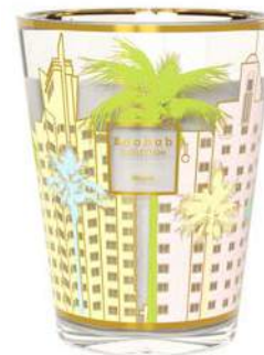
Miami Cypress - Cedar - Musk