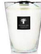
Madagascar Vanilla Frangipani - Vanilla