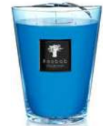
Nosy Iranja Sea Mist - Fig Leaves