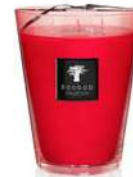
Maasai Spirit Ambergris - Pimento