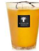
Zanzibar Spices Cinnamon - Turmeric