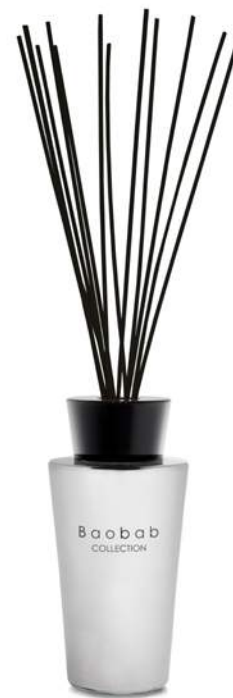
Lodge fragrance 500 ml