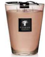
Serengeti Plains Bergamot - Rose