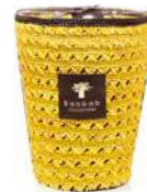
Diego Suarez Ylang - Orchid - Salt Flower