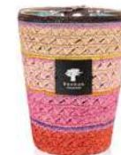
Ifaty Ylang - Orchid - Salt Flower