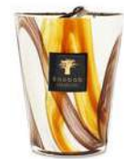
Spirit Cedar - Incense - Vanilla