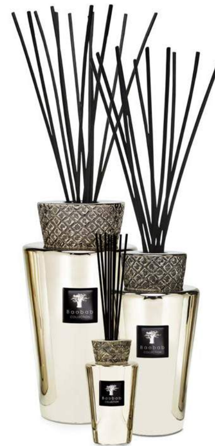
Totem Mini 250 ml - Medium 2 L - Large 5 L