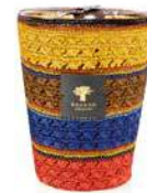
Morondava Mint - Vetiver - Ylang