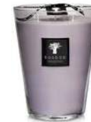
White Rhino Sandalwood - Vetiver