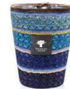
Nosy Be Vetiver - Sea Salt - Amber