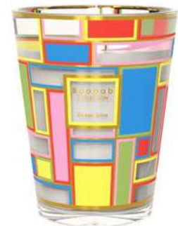
Ocean Drive Mandarin - Cedar