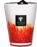
Feathers Maasai Patchouli - Rum Accord - Amber